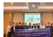
2 nd ICNFM-ICNFM2019 Venue: Shanghai, China

Venue: University of Science and Technology Liaoning, Anshan, China.