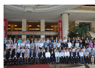
1 st ICNFM-ICNFM2018

Venue: University of Science and Technology Liaoning, Anshan, China.